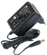
24 V 1.2 A power adapter