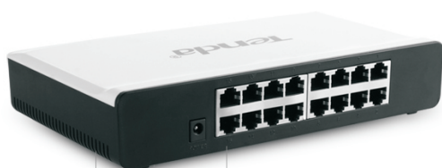
Side Vent Bottom Vent 94V0 Fireproof Plastic Housing