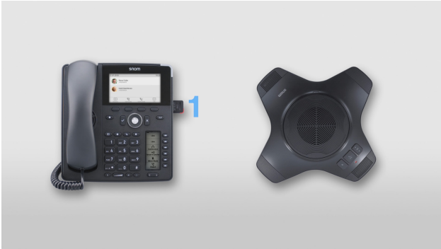
Plug the adapter into the device