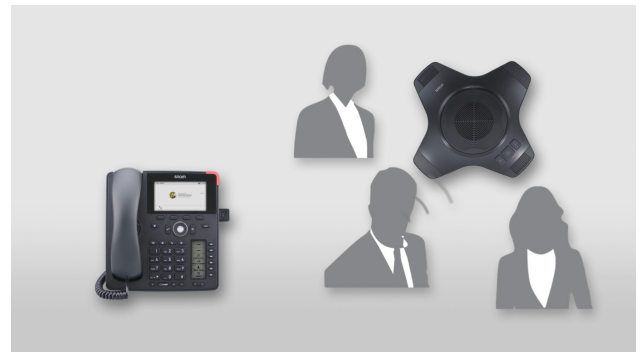
Now you can use the connected wireless speaker at up to 25 m distance