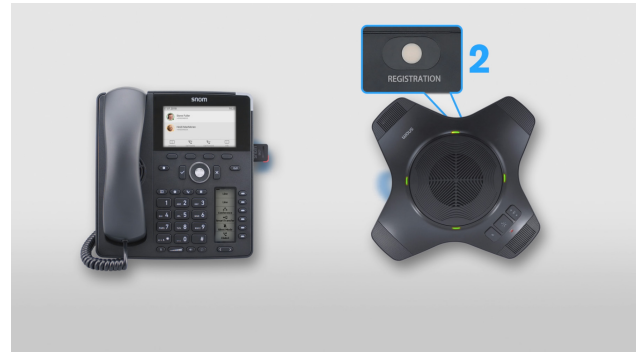
Establish a DECT link to the wireless speaker