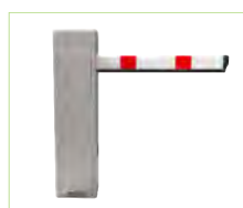
PB Series Automatic Barrier