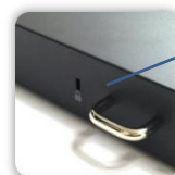
Kensington Lock &amp; U-bar Lock