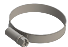
50-70mm hose clamp