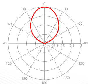
V/H - Port Pattern Azimuth 5.6 GHz